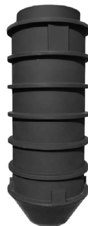
DEI FIN SP 800S