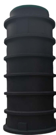
DEI FIN SP 800

Extension shaft NSO 800 - height 300 mm; external diameter Ø800 mm Cover PKO 800 - external diameter Ø800 mm